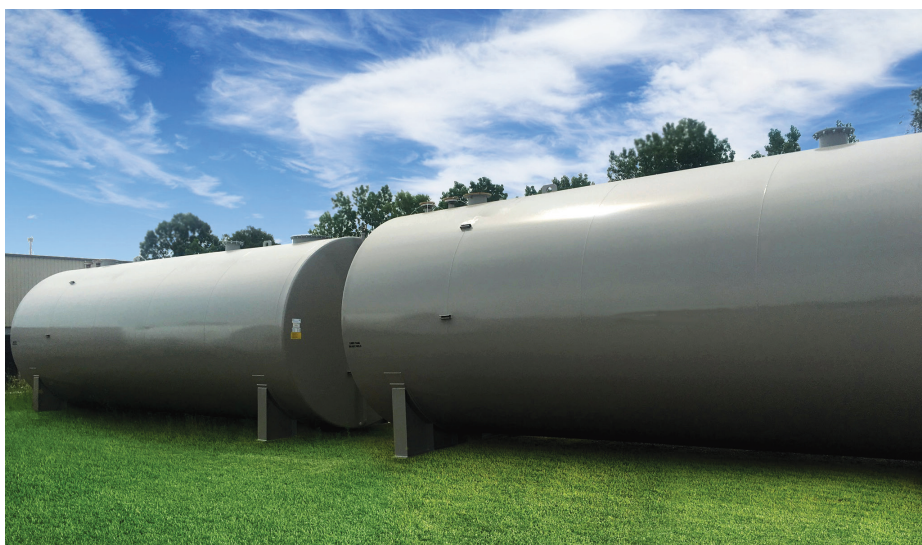
A fast-cure, high-build polyaspartic coating allowed these 20,000-gallon steel tanks to be coated and put to service quickly.

For more information, visit www.carboline.com or call (314) 644-1000. ●