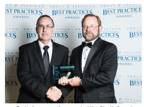
Carboline recently accepted the North American Anti-Corrosion Coatings New Product Innovation Award for Carboquick 200® and Carbozinc® 608 HB at Frost & Sullivan's Best Practices Awards Gala.

Carboline recently accepted the North American Anti-Corrosion Coatings New Product Innovation Award for Carboquick 200 and Carbozinc® 608 HB at Frost & Sullivan's Best Practices Awards Gala. Carbozinc 608 HB is the industry's only hybrid zinc primer that can be applied at twice the thickness of traditional epoxy zinc primers.