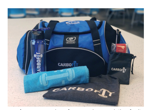
As an expression of care and appreciation for its employees, Carboline recently launched a corporate wellness program that has quickly gained popularity: CarboFit.

As an expression of care and appreciation for its employees, Carboline recently launched a corporate wellness program that has quickly gained popularity: CarboFit. Participants receive a "swag bag," which includes a gym bag filled with branded items, such as a water bottle, stretch bands, a t-shirt, towel, etc. The program is monitored through a website, but is also available on an app, so everyone can easily track their activity and see the competition. Speaking of competition, the program has fostered