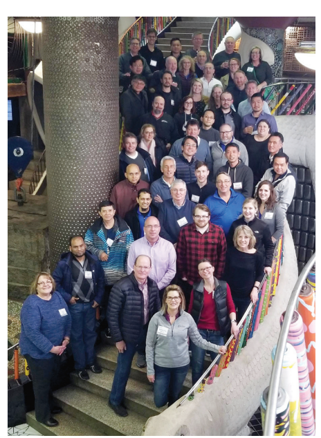
In March 2019, Carboline hosted its first Global RD&I Summit at its global headquarters and lab in